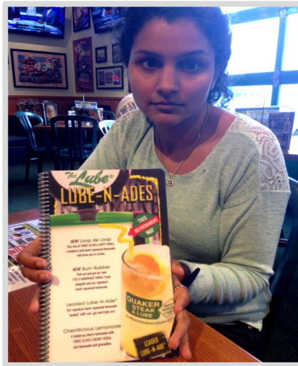
An Unhappy Jas