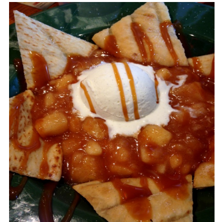
The Epitome of Dessert NACHOS

Overall, it was a great place. I would probably not have any official corporate meetings here (That would be reserved for Seasons 52). It would be a great place to watch the game, eat some wings (or nachos), and just unwind. We would go again!