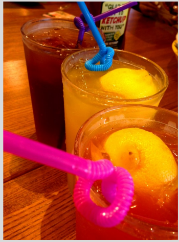
Lube-N-Ades and a Coke!